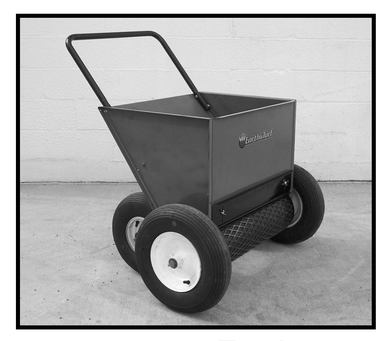
For TruFlow<sup>TM</sup> Topdresser 24D Series - Push-Type Unit